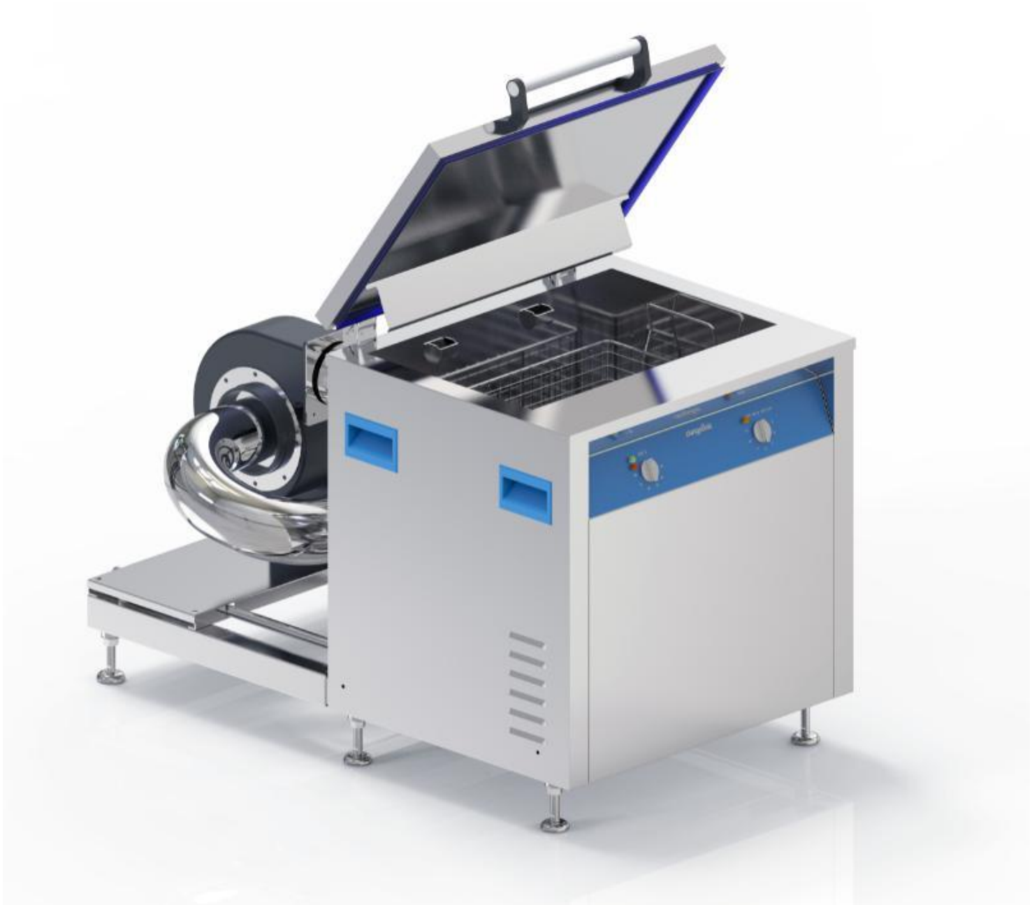
Optional Hot Air Drying Tank