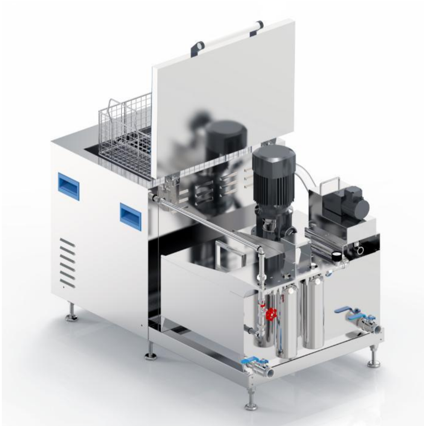
Optional Circulation System with Oil Skimmer For Heavy Duty and Oily Workpiece Cleaning