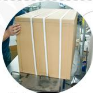
05 Plastic-belt for reinforcement