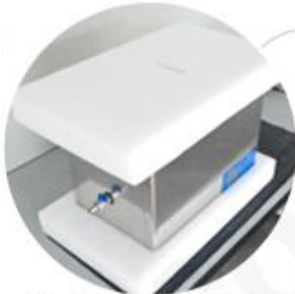
02 Shockproof EPS boards