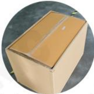
03 Outer box for double-protection