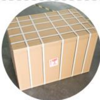
06 Ready to ship