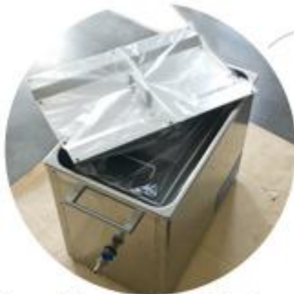
01 Wrapped in dustproof film bag