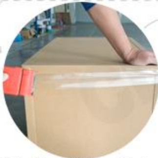
04 Sealed with multilayer adhesive tape